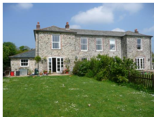
The house in Trevarth, Cornwall, which served as the Petherick family home from possibly the late 1810s to at least the early 1830s.

culture of Cornwall and the three went on to distinguish themselves internationally.